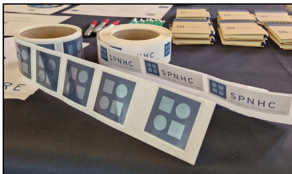
Figures: SPNHC booth (left) and the shiny new stickers (right) exhibited at the NatSCA 2025 conference.